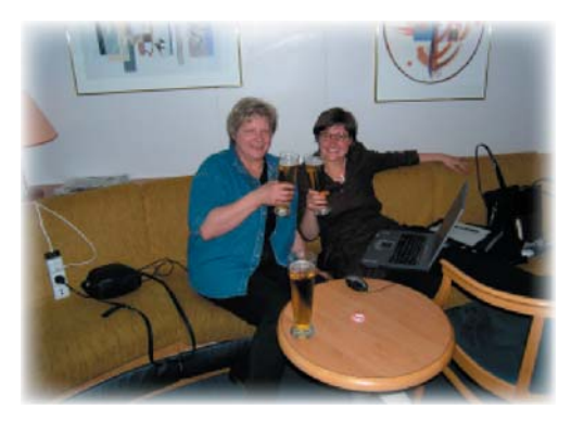
...well obviously with a lot of fun - and a good beer on the ferry on the way to Riga.