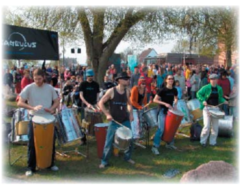
Sport, music and emotions: beside the track