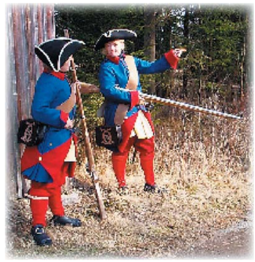
On the Road of War and Peace

The focus of the upcoming history tourism project was set to be on two wars: the Great Nordic War 1700-21 in which Denmark, Poland-Saxony and Russia attacked Sweden and the Russo-Swedish War 1808-1809 a part of Napoleonic wars in which Swedish kingdom lost Finland to Russia because it refused to participate in the Continental blockade against Britain.