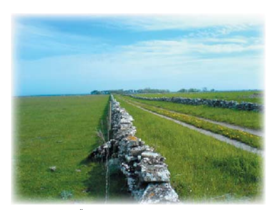
Pave your way on Öland, Sweden

Wolfgang Guenther Baltic 21 Tourism Task Force/ N.I.T.