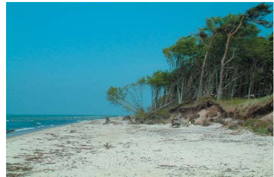
Coast area on Darss peninsula, GERMANY

In close relationship with the external experts of the Experts plc, based in Rostock, the concept for Agora was developed in the beginning of 2005 and the first product, namely Darss-Marathon 2006, was the result. Other products to ensure a sustainable tourism in this rural area will follow after the first attempt has been successful on 7 May 2006.