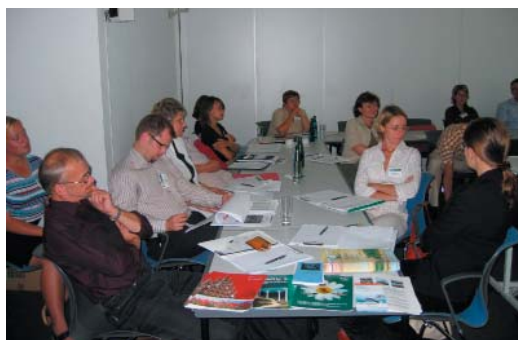
During the second day's partner meeting

On the third day an excursion was arranged to get an insight in Greifswald's surroundings and sustainable tourism development on the Island of Ruegen. The participants visited several touristic spots like the new WWF National Park Information Center, near the White Cliffs, their highest point "Kings Chair" and the eco farm in Bisdamitz.