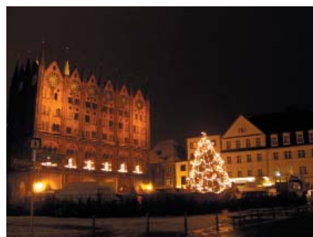
Christmas market and town hall in the Hanseatic town Stralsund, GERMANY

The Agora team in Greifswald wishes all project partners and newsletter readers a peaceful and joyful Christmas and a Happy New Year 2006!