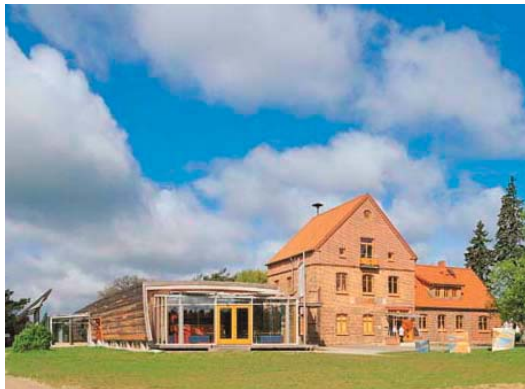
Darsser Arche's main building in Wieck, Darss, GERMANY

Being a partner of the Interreg III B “Agora” network, the National Park Center Darsser Arche wants to contribute a very special project. After several different approaches the idea of combining sport and environmental education under the name of “Darss-Marathon” finally became one of the pilot projects in Agora. The central aim of this pilot project is to develop sustainable tourism in the National Park area “Vorpommersche Boddenlandschaft” by transferring the National Park concern “let nature be nature” through sport events.