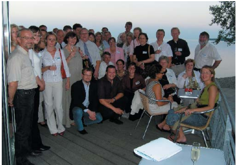
Participants of the AGORA-Kick-off Meeting