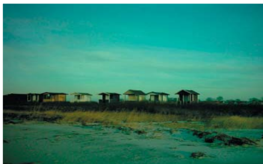
Skanör, Skane, Sweden