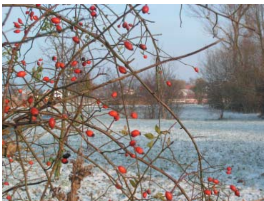
Early winter in Wieck, GERMANY