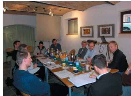
Participants of the Agora workshop on 22 November in Rostock.

During the meeting the external expert N.I.T. Kiel will give an overview of already existing approaches to check sustainability of tourism projects. This overview will be sent out some days before the meeting. The result of the meeting will be published on the Agora website.