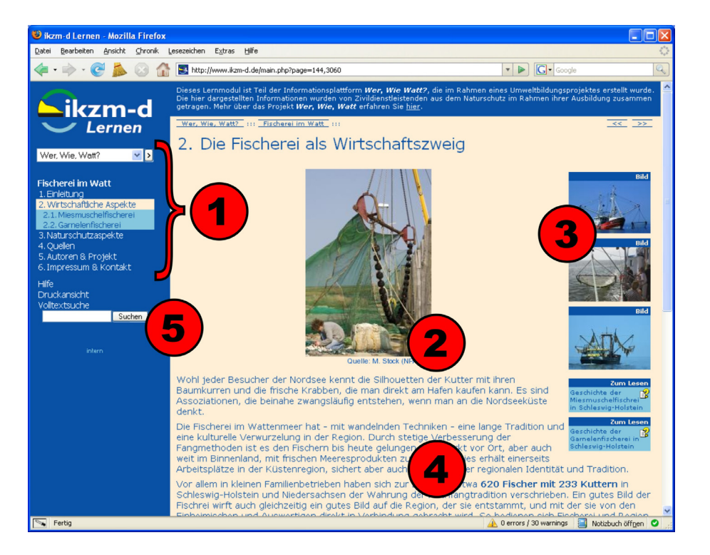
Figure 2: Basic components of online modules compiled with IKZM-D Lernen: