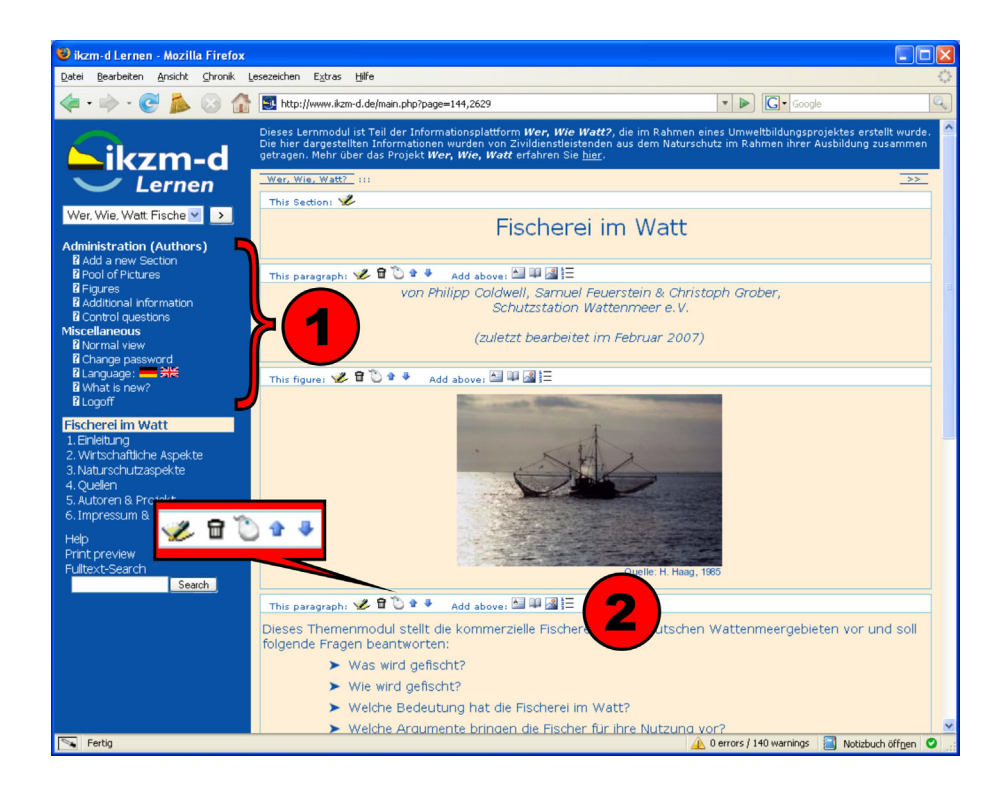
Figure 3: The author environment of IKZM-D Lernen :