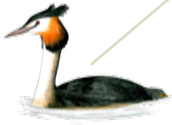
Great Crested Grebe